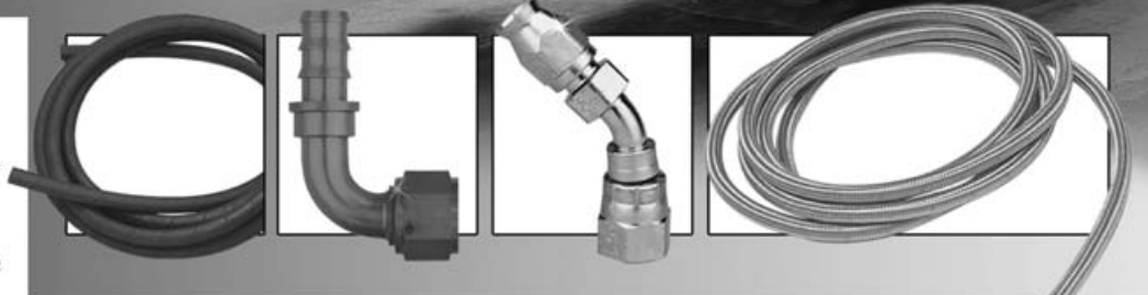
Startlite Nomex® Braided Racing Hose and Aluminum Fittings Fuel, Oil, Coolant, Air

Street muscle. For 68 years, Aeroquip has been the high performance plumbing of choice. Aeroquip is the only company that makes its own stainless steel braided hose and reusable fittings—you get a guaranteed, no-leak connection pass after pass, lap after lap. That's performance under pressure.