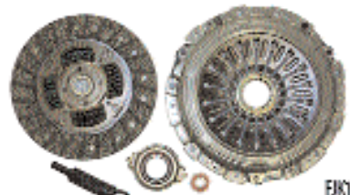
EK1002 Subaru Legacy & Legacy Outback 2007-08 2.5L GT Spec B, GT, GT Limited