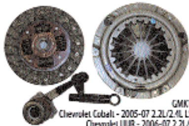
GMK1010 Chevrolet Cobalt - 2005-07 2.2L/2.4L LS, LT Chevrolet Impala - 2006-07 2.2L/2.4L Pontiac G5 - 2007-08 2.2L/2.4L