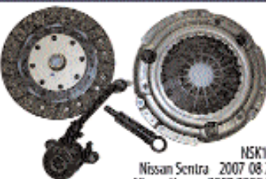
NSK1009 Nissan Sentra - 2007-08 2.0L Nissan Versa - 2007-2008 1.8L