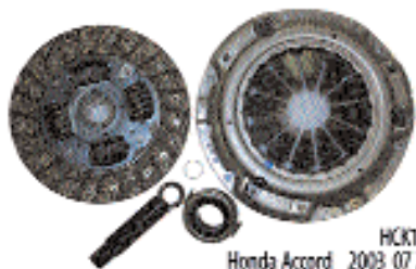
HCK1005 Honda Accord - 2003-07 2.4L