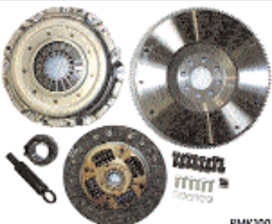
BMK1001TW Mini Cooper - 2002-07 1.6L S 6spd Supercharged Solid Flywheel to replace Dual Mass Flywheel